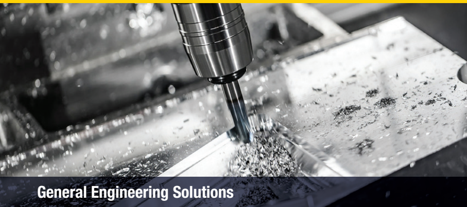
General Engineering Solutions