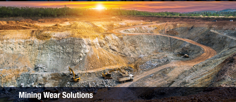
Mining Wear Solutions