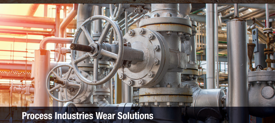
Process Industries Wear Solutions