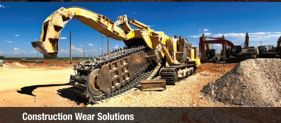
Construction Wear Solutions