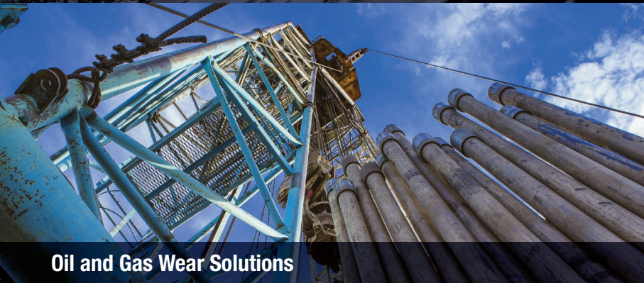
Oil and Gas Wear Solutions